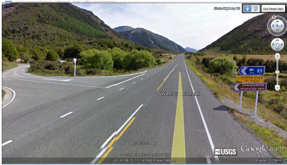
View of Craigieburn Picnic Area/Broken River Access Road approaching from Christchurch